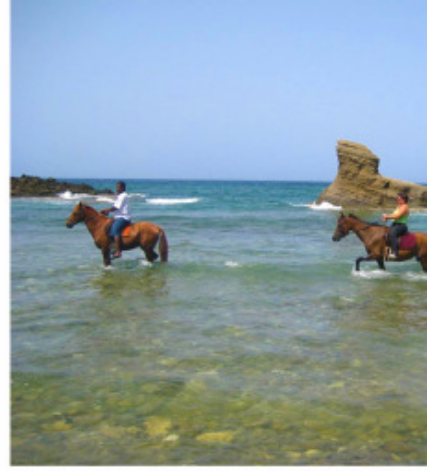
One of the two private beach coves.